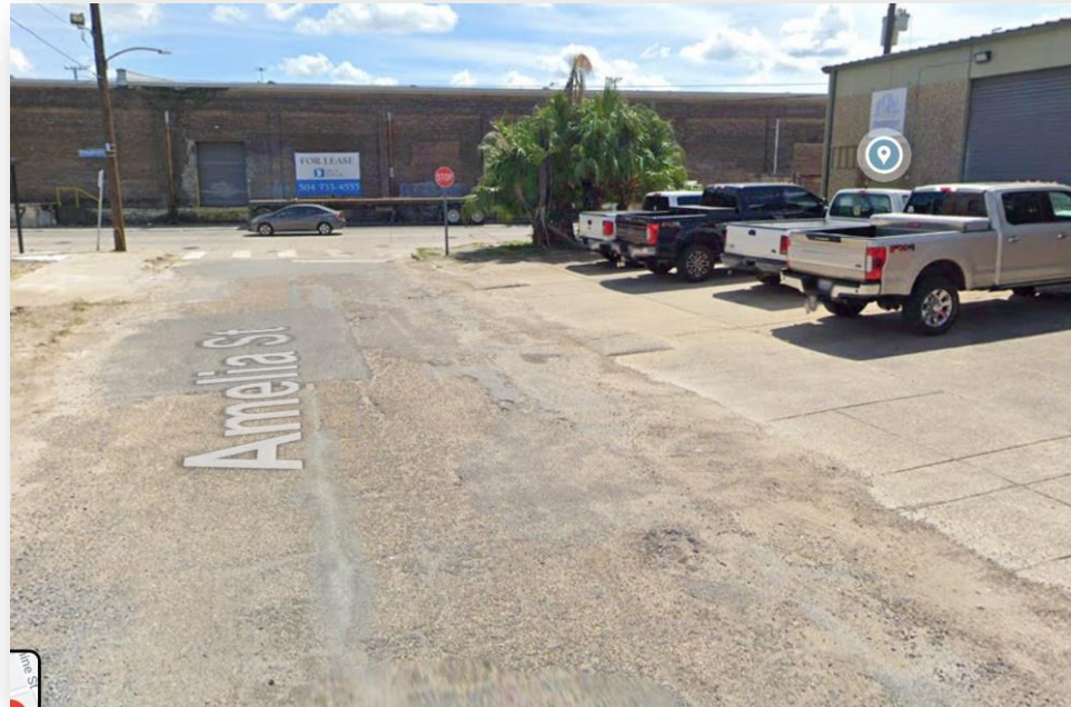
Existing conditions on the 700 block of Amelia Street.