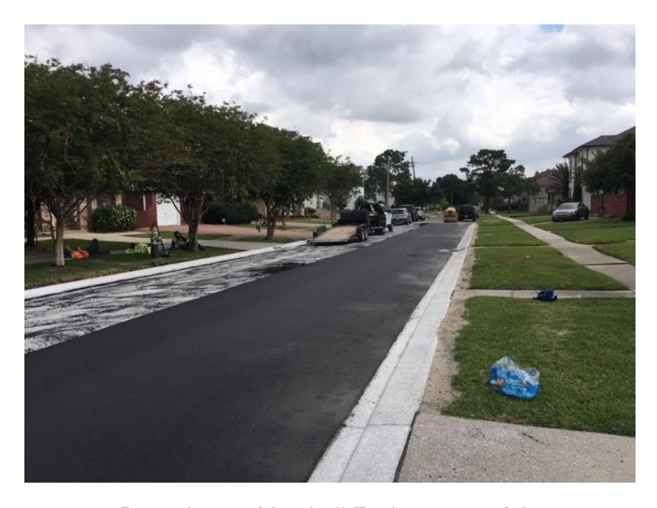
Repaving on Marshall Foch as part of the Lakeview North Group A Project